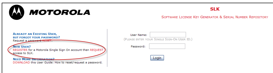
Figure 2 – SLK login window